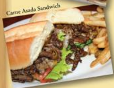
Carne Asada Sandwich