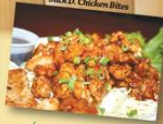
Jack D. Chicken Bites