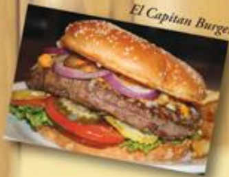
El Capitan Burger