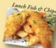
Lunch Fish & Chips