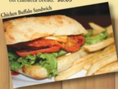
Chicken Buffalo Sandwich

breaded chicken, hot buffalo sauce, swiss cheese, lettuce, onions, tomatoes, on ciabatta bread. $8.69