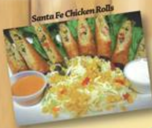
Santa Fe Chicken Rolls