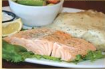
Grilled Salmon with dill butter

Prime Rib (Slow roasted 10 oz.) Fridays & Saturdays $15.99 (After 4 pm)